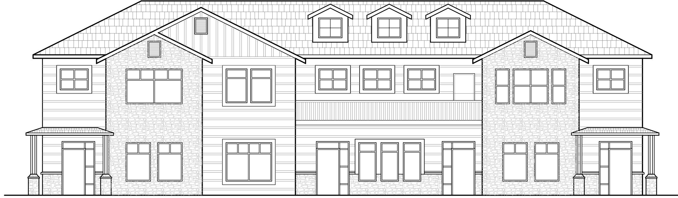
○ FRONT ELEVATION SCALE: 1/8" = 1'-0"

435.881.2168 440 North 250 West Smithfield, UT 84335